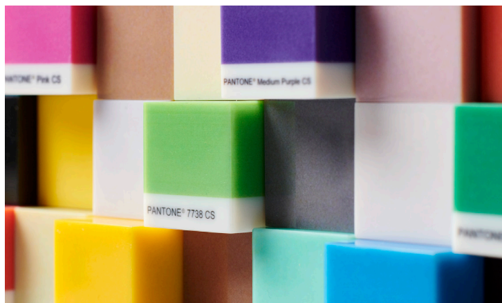
Pantone color blocks