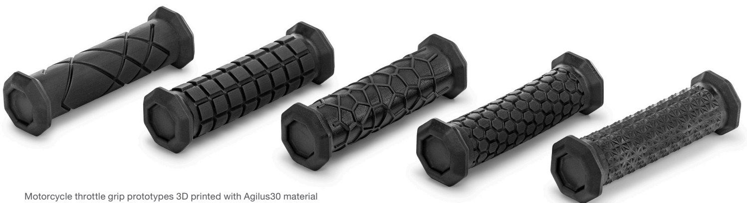
Motorcycle throttle grip prototypes 3D printed with Agilus30 material

With the J850 Pro, it's simple to create functional, multimaterial models that let you test and validate prototypes faster, and move through stakeholder review with ease. This leads to quicker decisions and approvals, helping you achieve product verification, increase throughput and save valuable time.