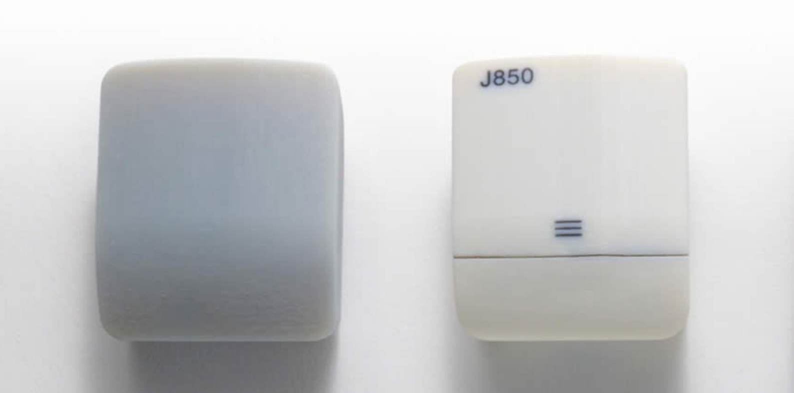
Earbud case prototypes 3D printed with DraftGrey (left) and VeroPureWhite (right)